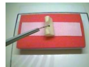
Extracorporeal Knot Tying